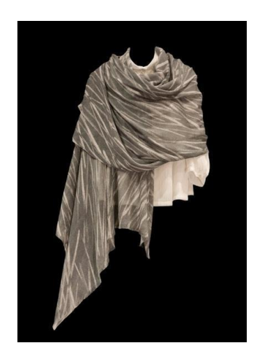
Patch Magic's Unique Shawls

Patch Magic (#03-05) celebrates the season with you, introducing its new silk and silk & cashmere mix shawls created by master craftsman. Using centuries-old Katazome technique of stencil dying that has been passed down from generation to generation of Japanese master craftsmen, Patch Magic adds a touch of finesse to its products. The shawls come with a complementary shawl pouch, courtesy of Patch Magic . Retailing from $380 . Promotion valid in Nov and Dec 2015 .