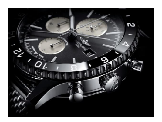
The Breitling Chronoliner: The authentic flight captain's watch

This Christmas, treat yourself or a loved one to a chronometer-certified chronograph, capturing the dauntless and tenacious spirit of aviation in an original and timeless style at Breitling (#01-04). Retailing at $9,930.