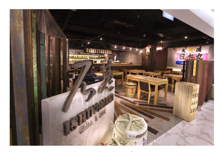
Ishinomaki Grill & Sake Bar

To spread the season's cheer, Phoenix La Beaute (#03-01) brings you the detoxification Universal Contour Wrap (UCW) and Anti-aging Facial treatment, at a special festive rate of just $198 nett (usual price $840) or you could sign up for just a detoxification UCW at $98 (usual price $438) and get a free UCW Cellulite Soap Bar (worth $30). Quote PC2015 when booking your appointment and promotions are valid for first time customers only. Promotion Dates: 29 Oct 2015 - 3 Jan 2016 .