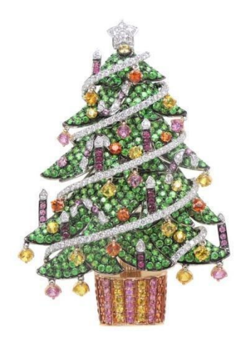
Christmas Tree Brooch

Brighten up your homes this Christmas with Strange & Deranged's home & lifestyle accessories this festive season! Receive a complimentary gift with minimum purchase of $300! Promotion Dates: 1 Nov - 25 Dec 2015. While stocks last.