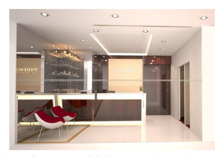
Universal Contour Wrap (UCW) and Anti-aging Facial treatment

Achieve 200% Faster & More Optimised anti-aging and skin brightening results in one remarkable treatment for a youthful radiant you this festive period courtesy of Touche Elite (#03-04) . Retailing at an introductory price of just $88*, be sure to jump on this offer while it is still available! Promotion Dates: Valid till 31 Jan 2016 .