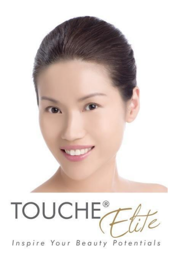
NEW! Advanced C PLUS Anti-aging Treatment with RF Tech

Pamper yourself with head-to-toe Christmas specials as Privé Aesthetics (#03-02) presents you with 12 days of Christmas e-coupons, comprising of 12 beauty treatments to leave you looking vibrant and refreshed throughout the holidays. For a full list of treatment descriptions, please visit www.priveaesthetics.com or call us at 6737 0755. Promotion Dates: 24 Nov 2015 - 6 Feb 2016.