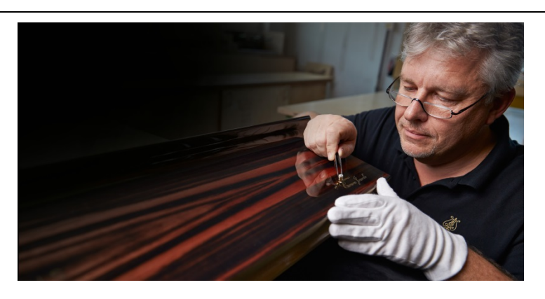
Crown Jewel - Macassar Ebony*

4 complimentary tunings* along with the purchase of a Crown Jewel - Macassar Ebony *Valid 1 – 14 May 2016.