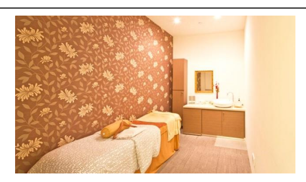
Mummy's Me-Time, $58

Renaza Nail Spa and Medical Aesthetics Spa (UK) (#03-10, #03-11)