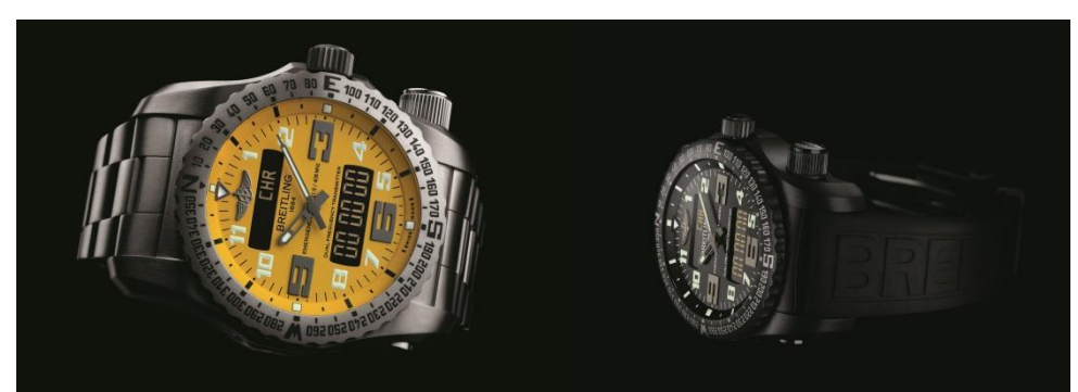
From left to right: Emergency II Cobra Yellow, Nightmission

Equip yourself for the Autumn hike with the world's first wristwatch with a dual frequency locator beacon from Breitling (#01-04). This season, the pioneer in the field of technical watches presents you the Breitling Emergency watch - a high-tech miniature marvel, that's packed with a rechargeable battery in an ultra-sturdy titanium case. It belongs to the PLB (Personal Locator Beacon) category with a dual frequency transmitter serving to issue alerts and guide search/rescue missions. The multifunctional electronic chronograph is also chronometer-certified by Cospas-Sarsat.