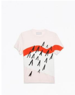
From left to right: Sretsis Zsa Zsa Leather Skirt, Crystalline Pearl and Jade Ring, Cocurata Trudy Benson Tee

Add a touch of quirkiness to the season with picks of creative designs and chic accessories from Lula Rock (#02-07). Straying away from the conventional herd, Lula Rock lives for the free-spirited and the recklessly trendy. Housing carefully curated pieces from cult labels and emerging designers from the quirky whimsies of Sretsis, to boldly casual chic Cocurata, Lula Rock appeals to the multi-faceted woman. Head to Lula Rock this season for an update to your closet with unique pieces only available at Palais Renaissance.