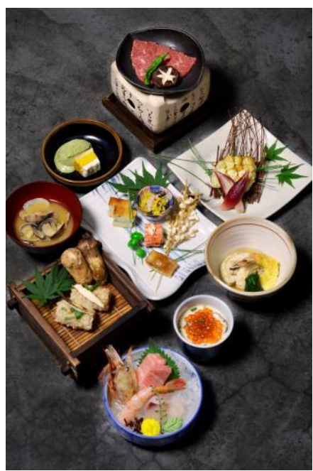
Shun no Mikaku (Taste of the Season) set menu