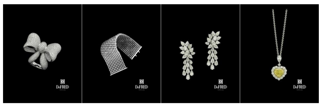
From left to right: Gifted, Allure, Glamorous, Heirloom

Feeling creative or getting inspired by the beautiful scenery of Fall? Customize your jewel designs at DeFRED Jewellers (#01-02). Established since 1984, DeFRED is a brand name synonymous with precious pieces of fine jewellery. DeFRED caters personalized and educational service, customized designs and impeccable quality. The Fall/Winter selection focuses on its gentle and graceful elements, sparking off your Autumn and Winter vibe with the fancy intense yellow diamond and colourless diamonds.